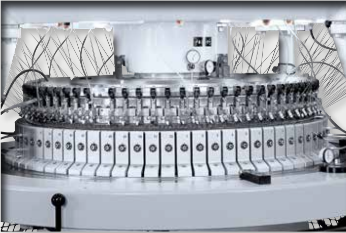
machine head of D4-2.2 X