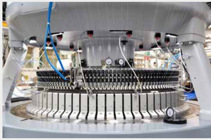
machine head of D4-2.2 X HPI Version